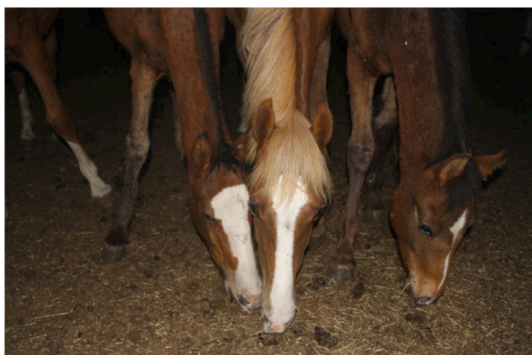
Image: Foals await slaughter at a Melbourne knackery

Non-traumatic causes of death were mostly of cardiac origin, with 16 horse deaths listed as cardiac or “collapsed and died,” often as a result of heart failure.