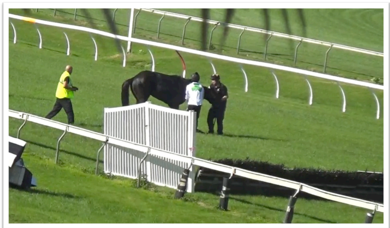
Image: Fieldmaster is euthanised at the Cranbourne Training Complex after breaking down during a jumps racing trial.

A 2-year-old filly was killed during training at Clarendon racetrack in NSW, she suffered a displaced fracture to the nearside pelvis. While her death went reported, most other states do not release this information about unnamed, unraced horses.