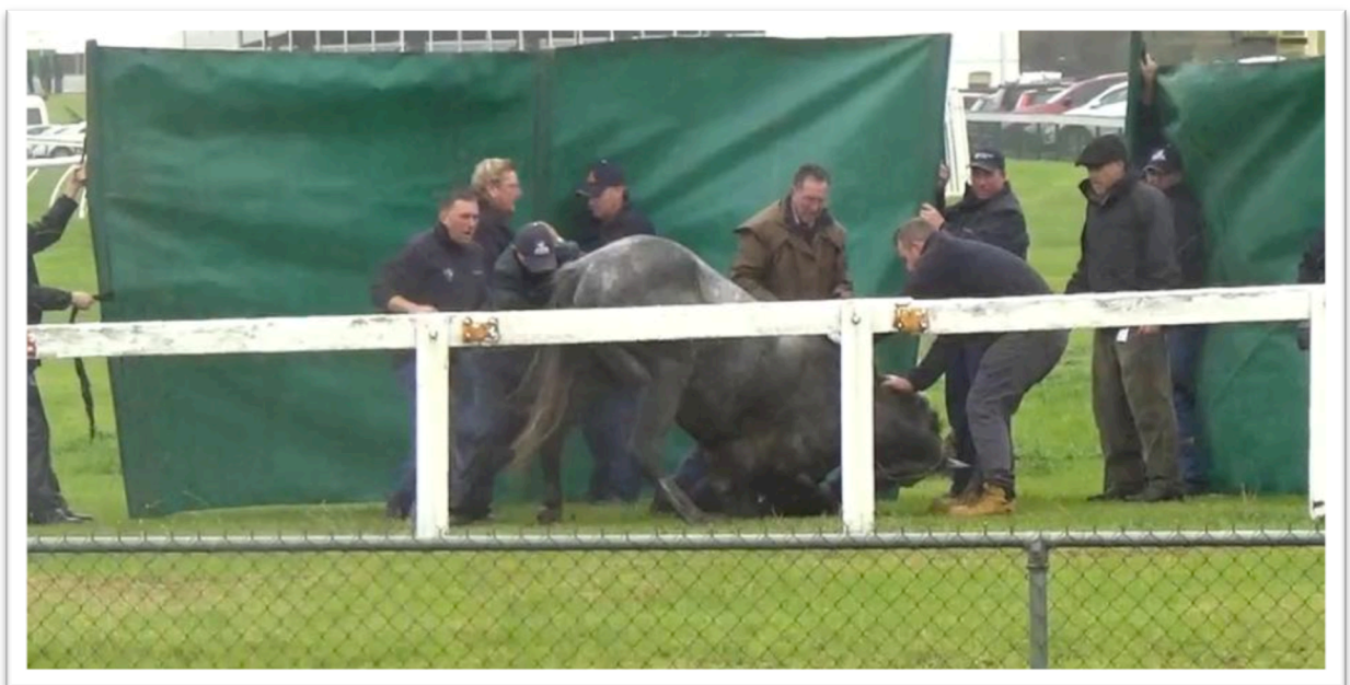
Image: Cliff's Dream being euthanised during the 2016 Warrnambool jumps carnival.

The 132 horses that died on track during this period represent 0.37% of the 36,000 horses racing each year. Many thousands more disappear or cycle out of the racing industry, also known as wastage .