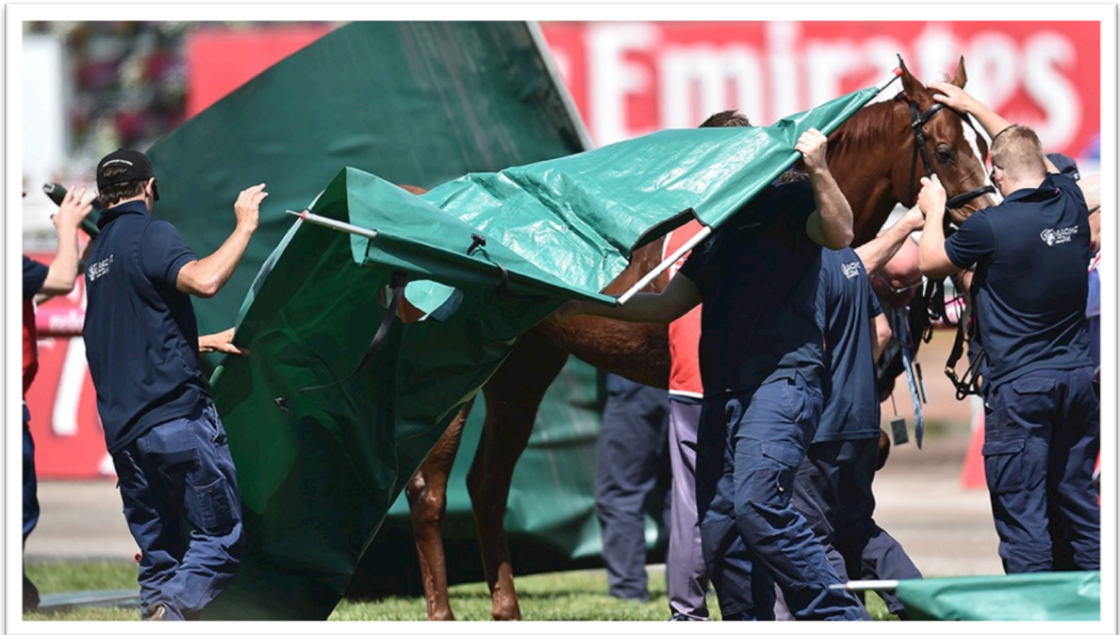
Image: Red Cadeaux is covered by the infamous green screen during the 2015 Melbourne Cup after sustaining injury. He died two weeks later

Data for the CPR Death Watch Report has been gathered from each state's official stewards reports, which are published on the individual state websites, as well as the Australian Racing Fact Book and various media outlets.